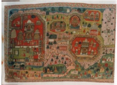
Figure 6: Calculated frequency evolution of modes detected in the BLS spectra.

In Fig. 6 the calculated frequencies of the most representative eigenmodes at +500 Oe (FM state) and - 500 Oe (AP state) are plotted as a function of the gap size d between the Py and Co sub units (please remind that in the real sample studied here, d = 35 nm). As a general comment, it can be seen that the frequencies for the system in the AP state are more sensitive to d than those of the P state. In particular, the lowest three frequency modes of the AP state (EM(Co), EM(Py) and F(Py)) are downshifted with respect to the case of isolated elements (dotted lines) and show a marked decrease with reducing d , while the two modes at higher frequencies (F(Co) and 1DE(Py)) have an opposite behavior even though they exhibit a reduced amplitude. In the P state (right panel), the modes concentrated into the Py dots exhibit a moderate decrease with reducing d , while an opposite but less pronounced behavior is exhibited by the F(Co) mode.