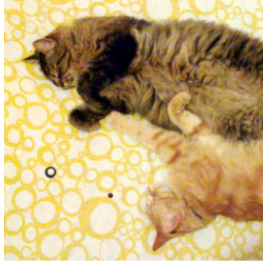
Figure 2: MFM images of the bi-component Py/Co dots for different values of the applied magnetic field which are indicated by greek letters along both the major and minor hysteresis loop.

We would like to mention that the DMM presents several advantages with respect to OOMMF for calculating the spectrum of magnetic eigenmodes for the following reasons: a) There is no need to excite the system by any magnetic field pulse, b) A single calculation allows to determine the frequencies and eigenvectors of all spin-wave modes of any symmetry, c) The spectrum is computed directly in the frequency domain, d) The mode degeneracy is successfully solved, e) The spatial profiles of the spin-wave modes are directly determined as eigenvectors and, finally, f) The differential scattering cross-section can be calculated accurately from the eigenvectors associated to each spin-wave mode. This is a clear indication that both the Py and Co sub-elements are in a single domain state where Py and Co magnetizations are all oriented with their magnetic moment along the chain and field direction. At point \alpha ( H = -372 Oe) of the hysteresis loop, where the plateau is observed in the M - H loop, the dark and bright spots of the Py dots are reversed with respect to those of Co, accounting for an antiparallel relative alignment of magnetization.