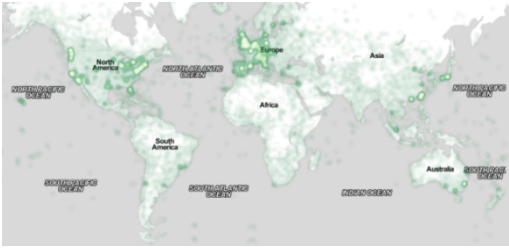
Figure 4: Calculated spatial distribution of the in-plane dynamic magnetization.

We have also used MFM to measure the magnetic configurations along the minor hysteresis loop, described above. Once the AP ground state has been generated at H = -500 Oe, the applied field is increased in the positive direction. The MFM image taken at point of Fig. 2, remanent state of the minor loop ( H = 0 ), shows that the AP state is stable and remains unchanged until the magnetic field is increased up to +300 Oe where the Py magnetization reverses its orientation and returns to be aligned with that of Co dots. On the basis of the above MFM investigation, one can say that the structures are always in a single domain state, while the relative magnetization orientation between the adjacent Py and Co elements depends on both the field value and the sample history.