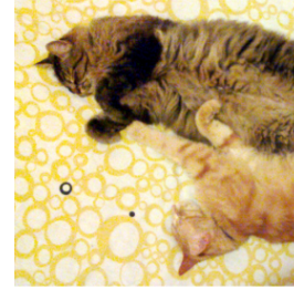
Figure 2: MFM images of the bi-component Py/Co dots for different values of the applied magnetic field which are indicated by greek letters along both the major and minor hysteresis loop.

To directly visualize the evolution of the magnetization in the Py and Co subunits of our bi-component dots during the reversal process, we performed a field-dependent MFM analysis whose main results are reported in Fig. 2. At large positive field ( H = +800 Oe, not shown here) and at remanence ( \alpha point of the hysteresis loop of Fig. 1), the structures are characterized by a strong dipolar contrast due to the stray fields emanated from both the Py and Co dots.