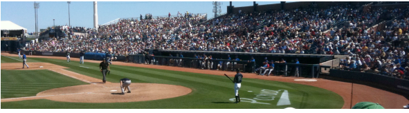
Figure 1: MOKE hysteresis loop for the bi-component Py/Co dots array measured along the dots long axis.

single and multi-layered confined magnetic elements with different shape and lateral dimensions [1–3]. This interest has been further renewed by the emergence of the spin-transfer torque effect, where a spin-polarized current can drive microwave frequency dynamics of such magnetic elements into steady-state precessional oscillations. Moreover, the knowledge of the magnetic eigenmodes is very important also from a fundamental point of view for probing the intrinsic dynamic properties of the nanoparticles. Besides, dense arrays of magnetic elements have been extensively studied in the field of Magnonic Crystals (MCs), that is magnetic media with periodic modulation of the magnetic parameters, for their capability to support the propagation of collective spin waves [4,5]. It has been demonstrated that in MCs the spin wave dispersion is characterized by magnonic band gaps, i.e. a similar feature was already found in simple two-dimensional lattices with equal elements like