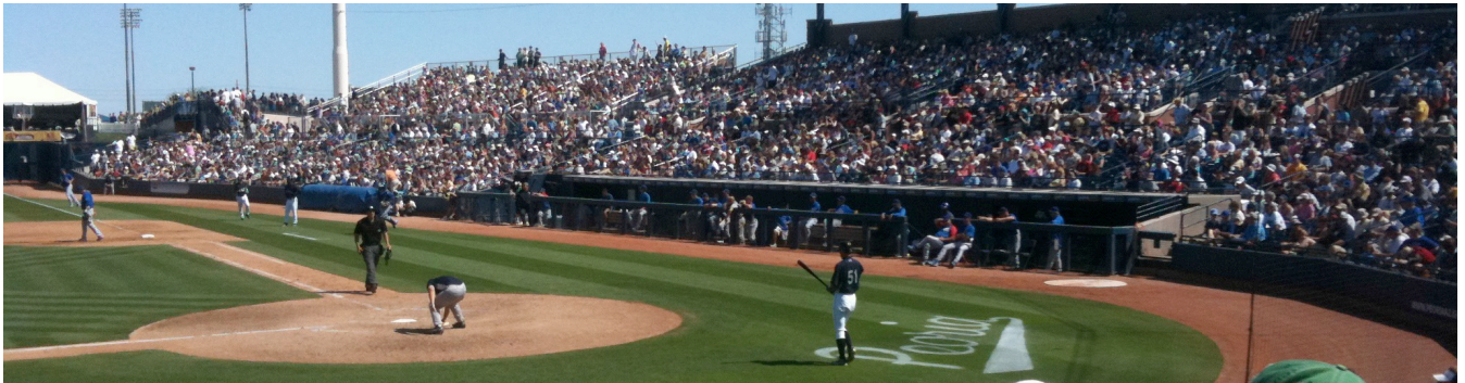
Figure 1: Ceci est un "teaser", c'est optionnel, vous n'en mettez un que si vous le souhaitez