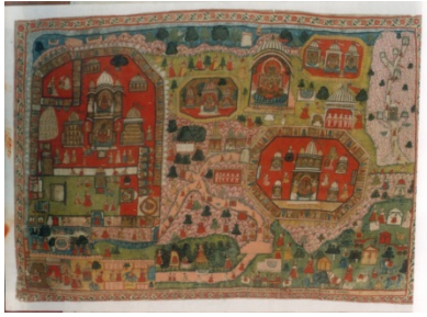
Figure 6: Calculated frequency evolution of modes detected in the BLS spectra.

In Fig. 6 the calculated frequencies of the most representative eigenmodes at +500 Oe (FM state) and − 500 Oe (AP state) are plotted as a function of the gap size d between the Py and Co sub units (please remind that in the real sample studied here, d = 35 nm). As a general comment, it can be seen that the frequencies for the system in the AP state are more sensitive to d than those of the P state. In particular, the lowest three frequency modes of the AP state (EM(Co), EM(Py) and F(Py)) are downshifted with respect to the case of isolated elements (dotted lines) and show a marked decrease with reducing d , while the two modes at higher frequencies (F(Co) and 1DE(Py)) have an opposite behavior even though they exhibit a reduced amplitude. In the P state (right panel), the modes concentrated into the Py dots exhibit a moderate decrease with reducing d , while an opposite but less pronounced behavior is exhibited by the F(Co) mode.